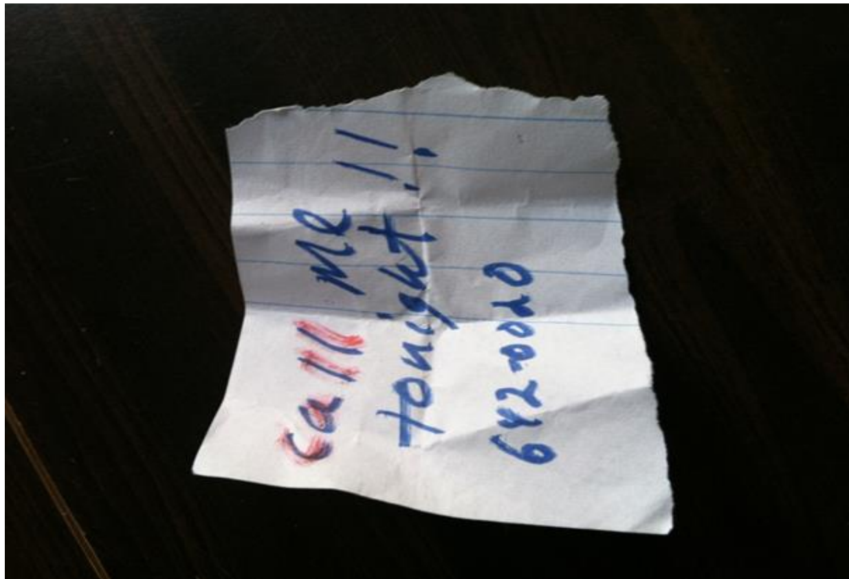
Zupec – Exhibit A